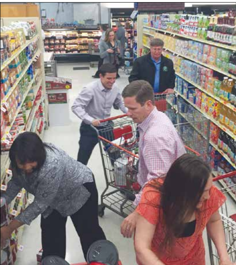
This year's competitors battle it out in the same aisle at the Race for Hunger.

Over $5,000 in scholarships available to LCFB members! ~ ~ ~ Check out www.lcfb.com or call 847-223-6506 for more details!